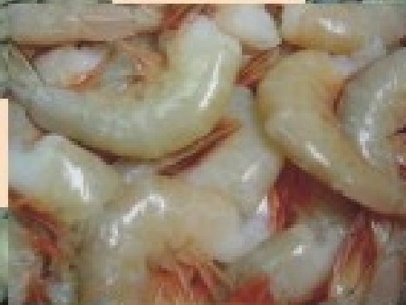
Headless White Prawn 去頭白蝦