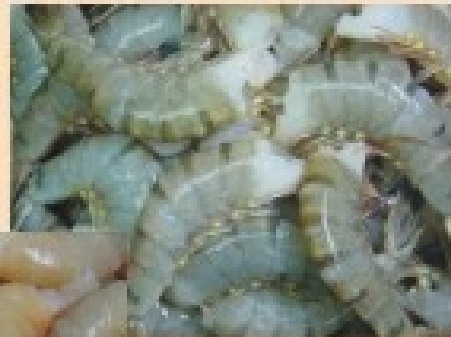
Headless Tiger Prawn 去頭虎蝦