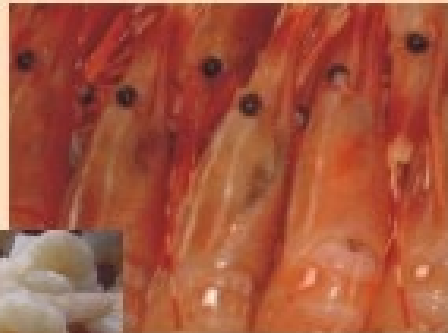
Raw Bolan Ebi 原隻牡丹蝦