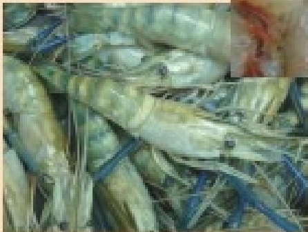
Head-on Fresh Water Prawn 有頭淡水蝦(大頭蝦)