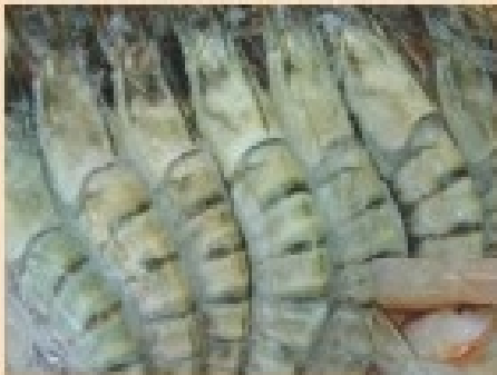
Head-on Tiger Prawn 有頭虎蝦