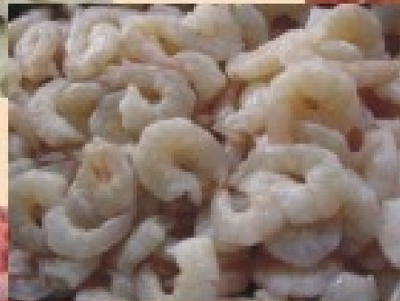
White Shrimp Meat 白蝦肉