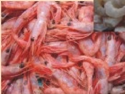
Raw Coldwater Shrimp 有頭甘蝦