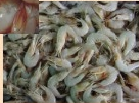
Head-on Seacaught White Shrimp 有頭海白蝦