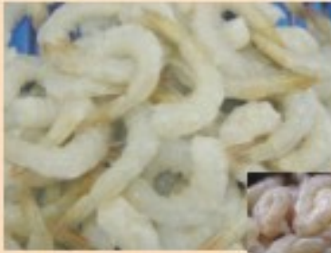
Peeled-tail-on Shrimp 鳳尾蝦