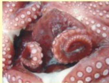
Whole Cooked Octopus 熟八爪魚