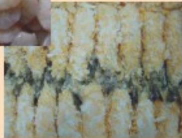
Breaded PTO Shrimp 吉列鳳尾蝦