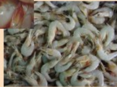
Head-on Seacaught White Shrimp 有頭海白蝦