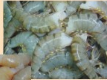
Headless Tiger Prawn 去頭虎蝦