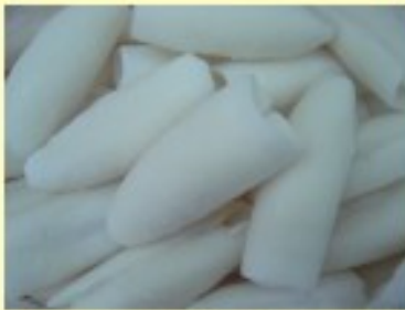
Squid Tube 魷魚筒