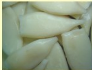
Cuttlefish Fillet 墨魚柳