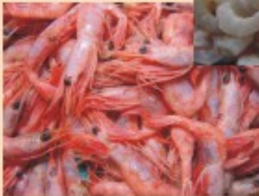
Raw Coldwater Shrimp 有頭甘蝦