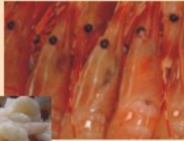
Raw Botan Ebi 原隻牡丹蝦