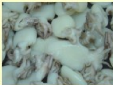
Baby Cuttlefish 墨魚仔