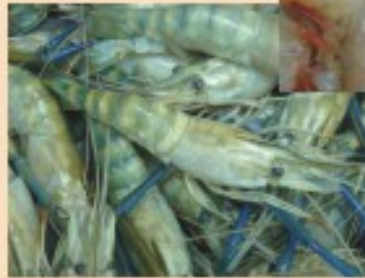
Head-on Fresh Water Prawn 有頭淡水蝦(大頭蝦)