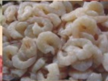
White Shrimp Meat 白蝦肉