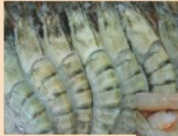
Head-on Tiger Prawn 有頭虎蝦